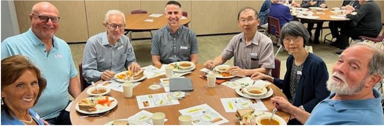
Okanagan Valley luncheon at Mission Creek Alliance Church in Kelowna