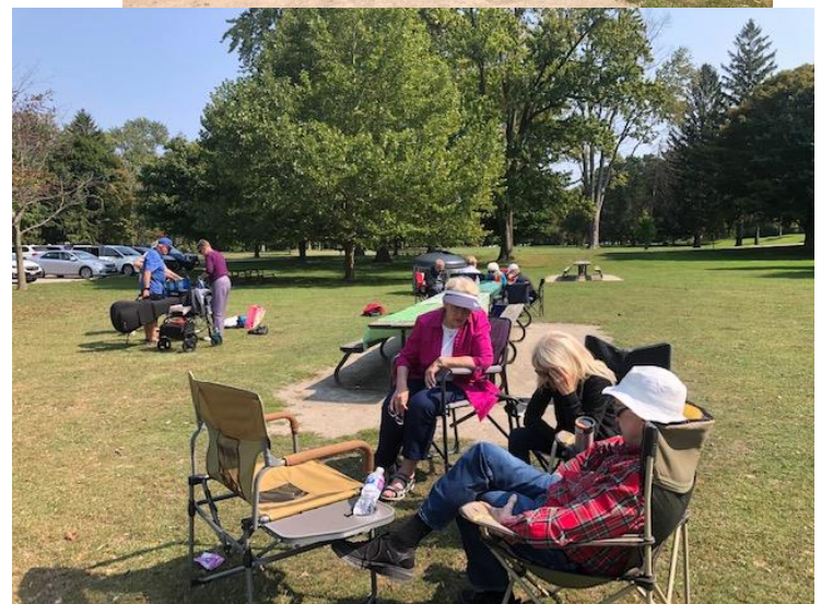
Divided into 3 groups. You see one group still praying and one group packing up to leave.