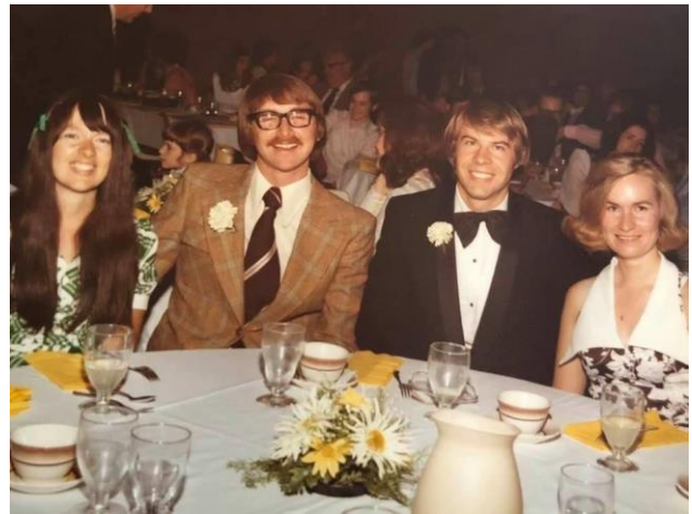
Can you name these people in these two pictures?