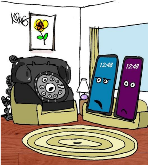
"Oh no, here comes another one of his 'back in my day' stories."