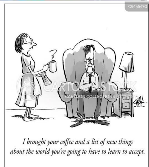
I brought your coffee and a list of new things about the world you're going to have to learn to accept.