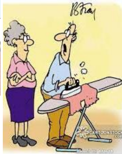
"THIS ISN'T WHAT I HAD IN MIND WHEN I SAID I WANTED TO BE IRON MAN!"